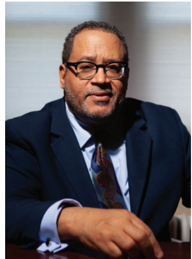
Michael Eric Dyson, Ph.D.

Dyson's legendary ascent - from welfare father to Princeton Ph.D., from church pastor to college professor, from a factory worker who didn't start college until he was 21 - may help explain why writer Naomi Wolf terms him "the ideal public intellectual of our time."