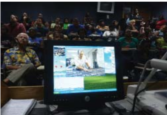
Podium view of the lecture