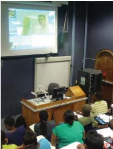
Audience view of the lecture