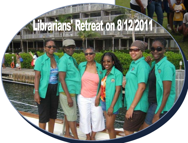
Librarians' Retreat on 8/12/2011

Librarians participated in a two day retreat, which included professional development on the August 11, 2011 and teambuilding activities on August 12, 2011.