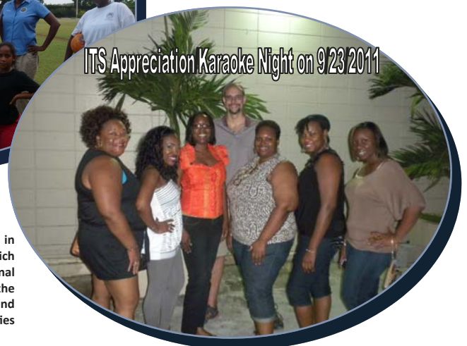
ITS Appreciation Karaoke Night on 9/23/2011

ITS staff participated in Karaoke night at Johnny's on September 23, 2011 to show appreciation to staff for all their hard work performed during this fiscal year and ongoing.