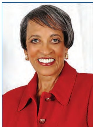
Johnnetta B. Cole, Ph.D.