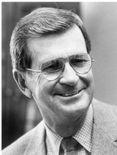
The Honorable Ron de Lugo

He was elected to four terms in the Legislature of the U.S. Virgin Islands, from 1956-1960 and from 1962-1966, interspersed by an appointment as St. Croix Administrator from 1961-1962. He was a member of the Democratic National Committee from 1959-1966. A growing network of national political alliances led to Congress giving the people of the Virgin Islands the right to elect their own governor in 1968 for the first time in history. In 1968, de Lugo was elected to the first of two terms as Washington Representative. In November of 1972, de Lugo was elected the first Congressional Delegate from the U.S. Virgin Islands and served ten terms, achieving sufficient seniority by 1989 to become Chairman of the Interior Subcommittee on Insular and International Affairs.