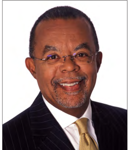
Henry Louis Gates, Jr. - Ph.D.

The recipient of 52 honorary degrees and numerous prizes, in 1998 he became the first African American scholar to be awarded the National Humanities Medal presented by President Bill Clinton.