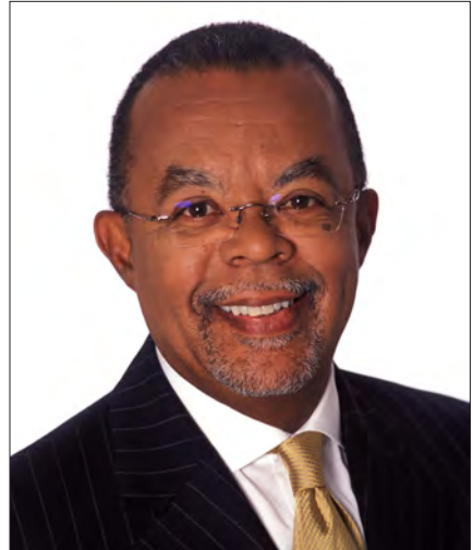
Henry Louis Gates, Jr. - Ph.D.

The recipient of 52 honorary degrees and numerous prizes, in 1998 he became the first African American scholar to be awarded the National Humanities Medal presented by President Bill Clinton.